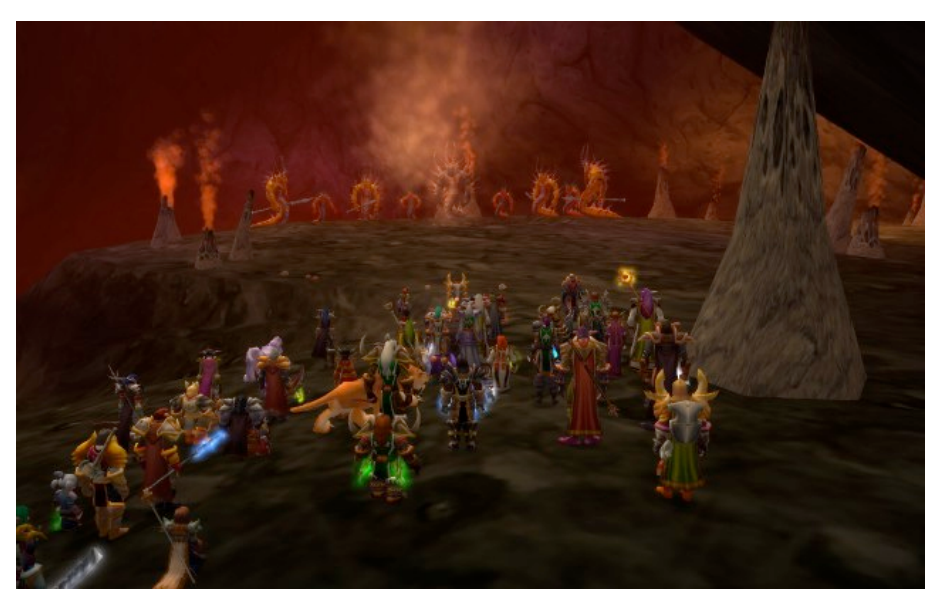
Eternal Vigils next target, Majordomo Executus.

Once again Eternal Vigil has shown that if we work togeather we can achieve alot. Today we got to see our next challanger, Majordomo Executus. We did however leave him for this day, but only to come back next week when he least expects it. Grove of Eternal Balance attended with no more than 11 of our members, wich is a new record.