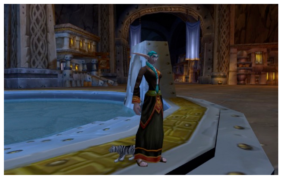
Chindo's friend Gandiral.