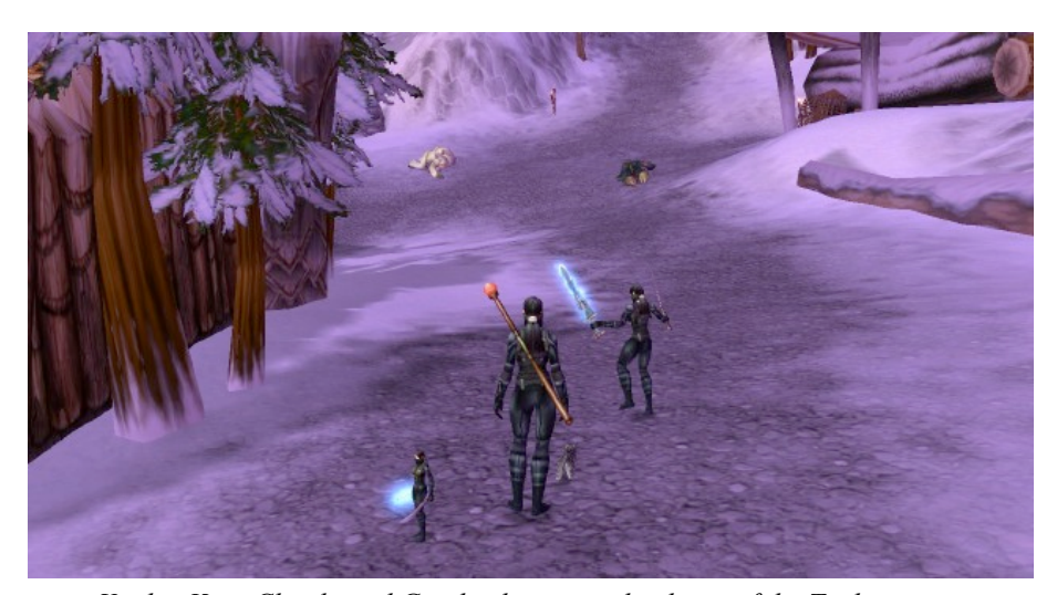
Yezika, Kiia, Chindo and Gandiral earning the thrust of the Timbermaws.

After the successful campain in Felwood some of us decided to dress up in ninja clothes and visit the local Timbermaws to try to work on our relationship with them. Went quite good, but they are demanding bears thoug.