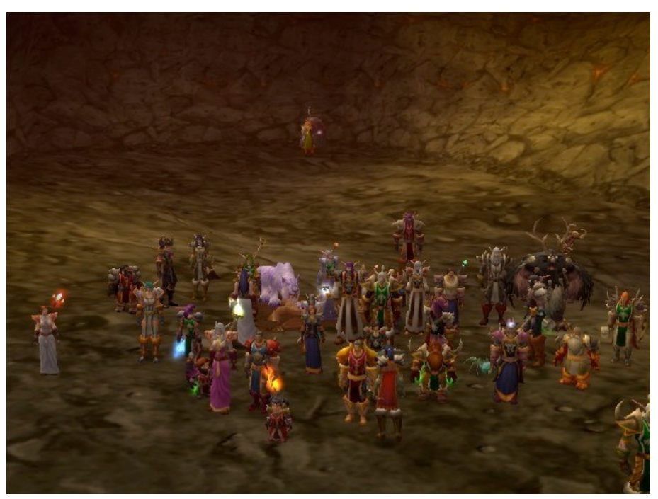
Eternal Vigil after defeating Magmadar in Molten Core.

We did yet another raid into the Molten Core at the late hours took place.