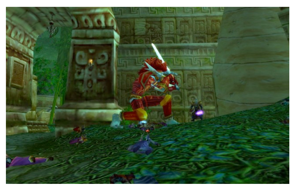
Bloodlord Mandokir thinks he can defeat Eternal Vigil. Think again.

Eternal Vigil however hosted a raid to the troll temple of Zul'Gurub to show them that we haven't forgotten about them quite yet. Some of us could not join our group, instead they gathered in Silithus to helping Cenarion Circle against the Twilight's Hammer and the Silithids.