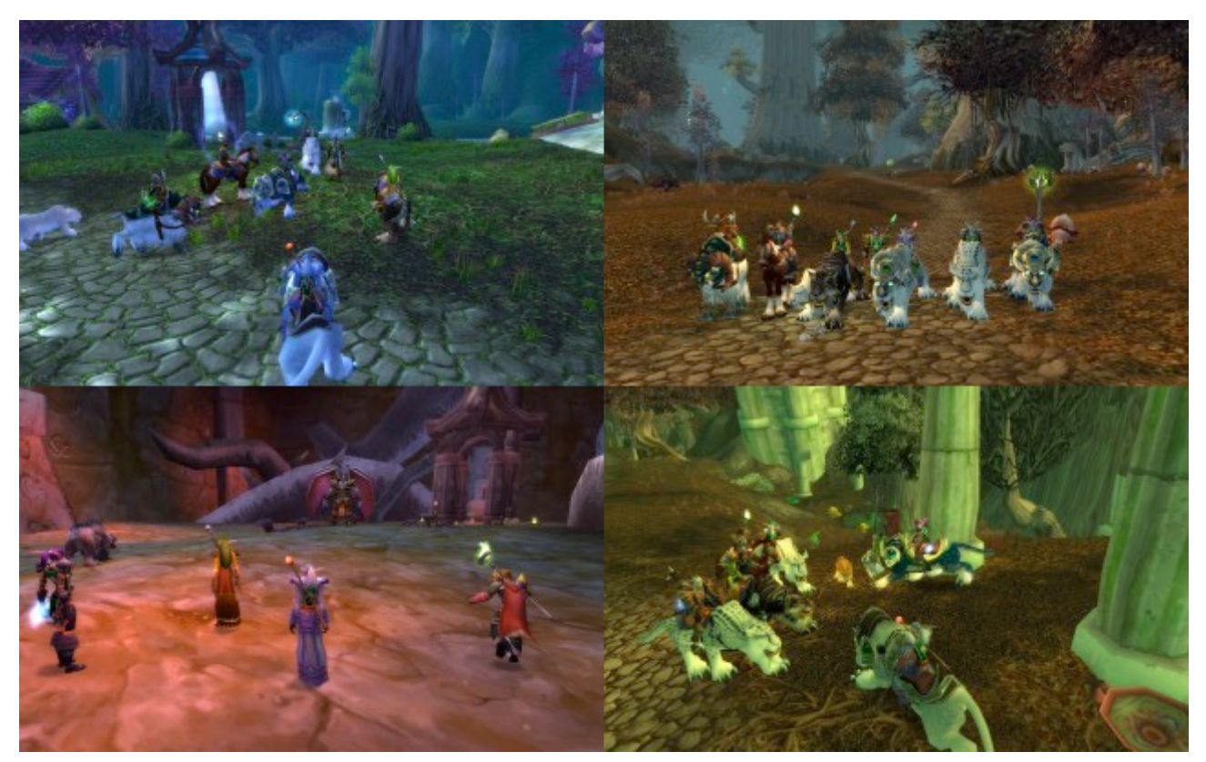
Grove of Eternal Balance's Felwood campain.

Today was the day when it should happend. The fall of the Shadow Council in Felwood. Parts of Grove of Eternal Balance gathered up in Astranaar and the travel to Felwood begun. Lord Banehollow did not offer much of a challenge to our group, and that made us a bit suspicious. Was he not the highest leader, or it was just a minnion he had put there to confuse us? We will continue our investigation and see what we can come up with.